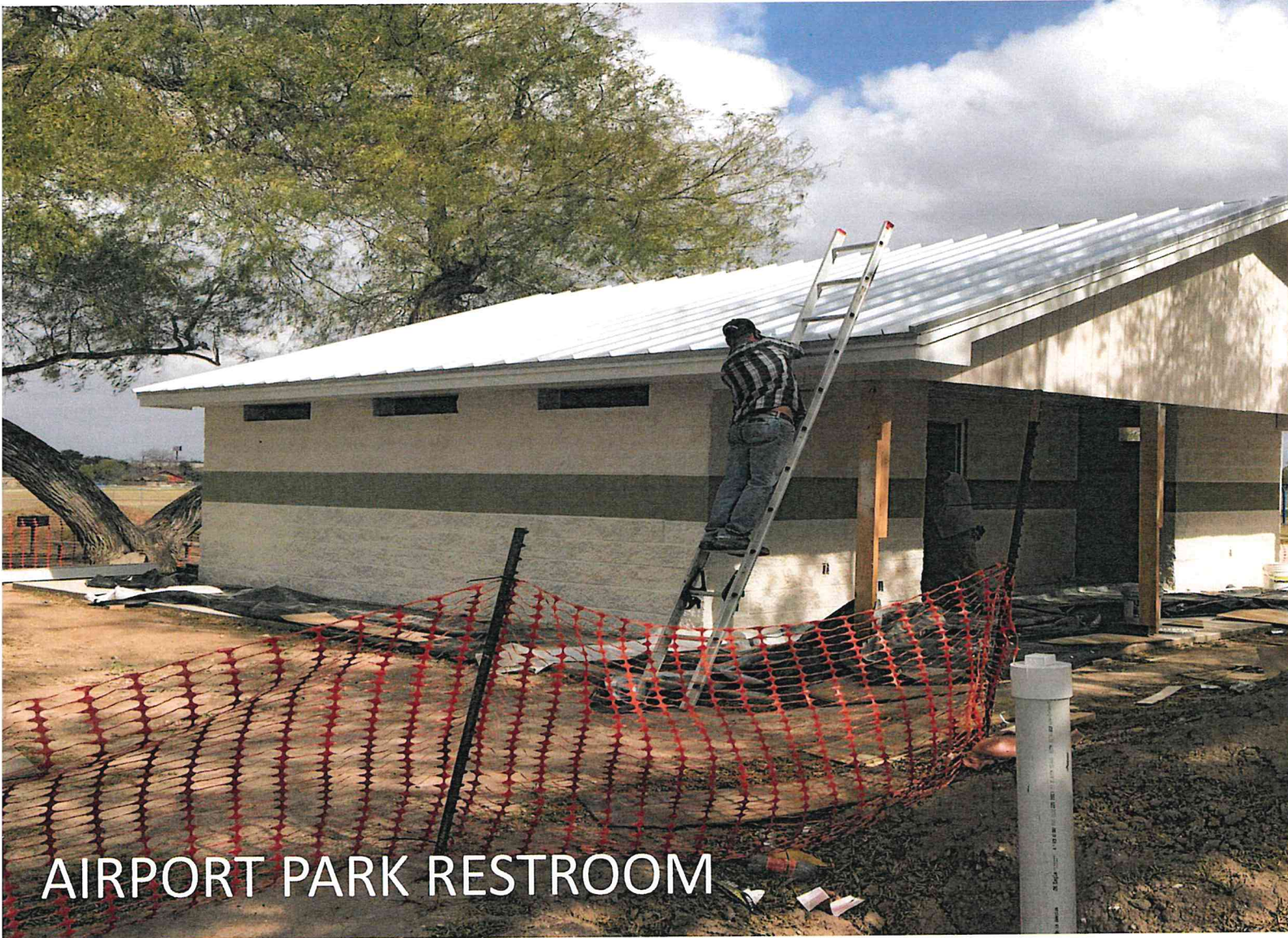
AIRPORT PARK RESTROOM