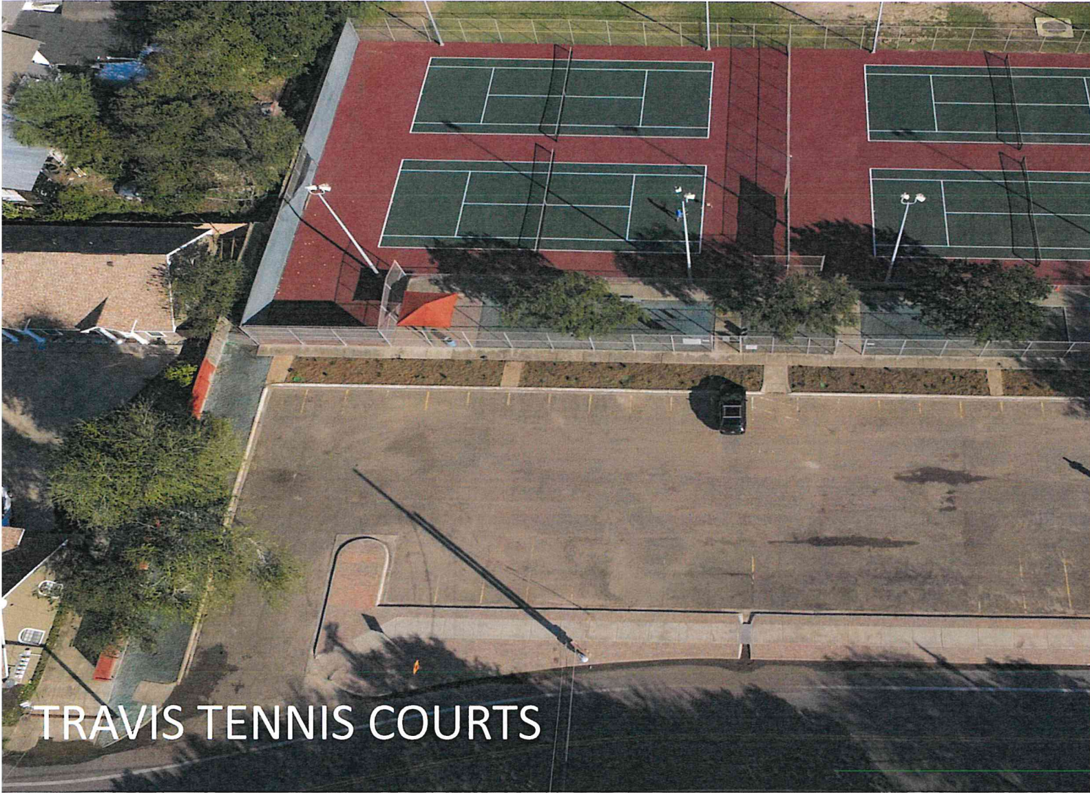
TRAVIS TENNIS COURTS