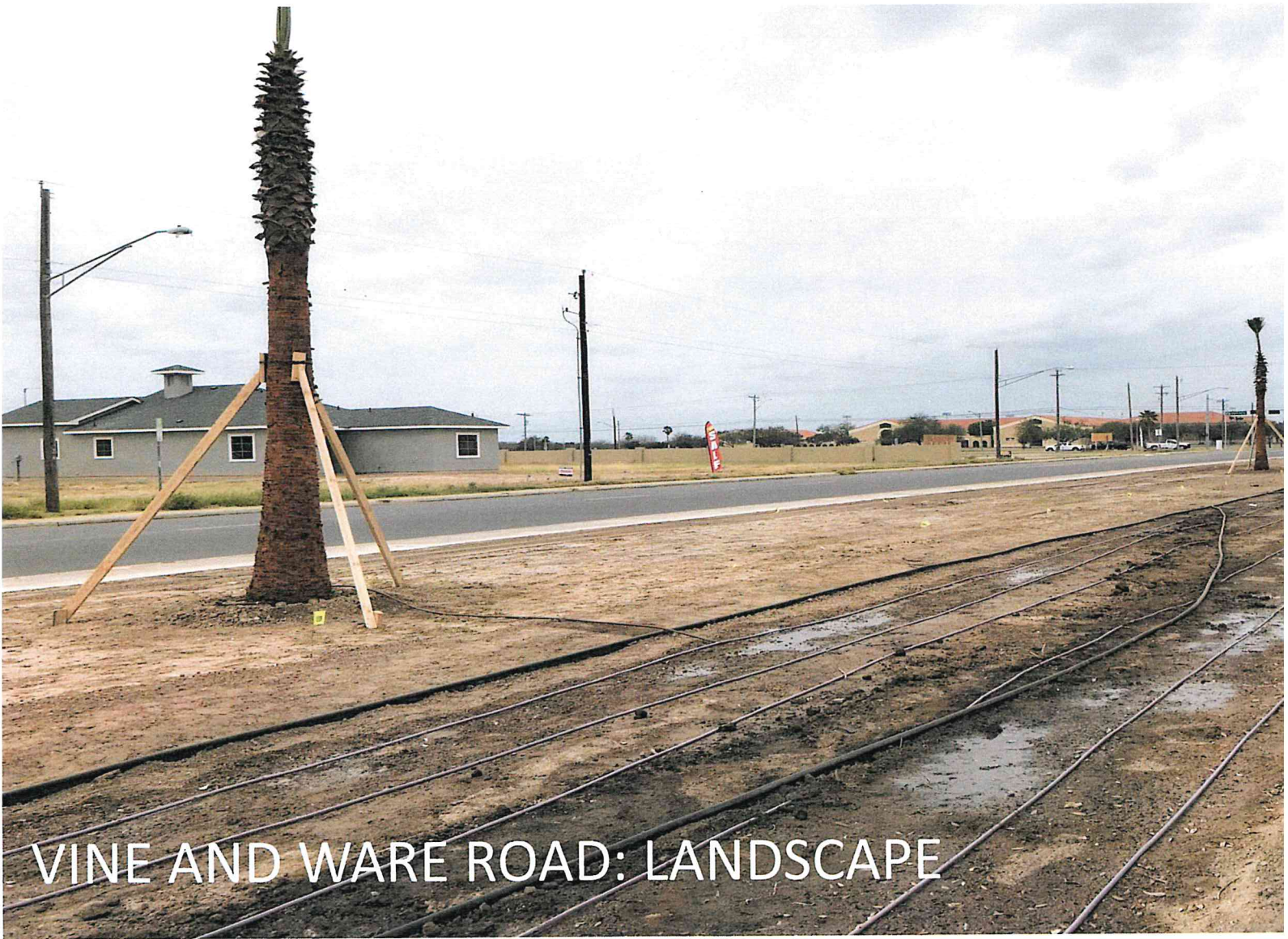
VINE AND WARE ROAD: LANDSCAPE