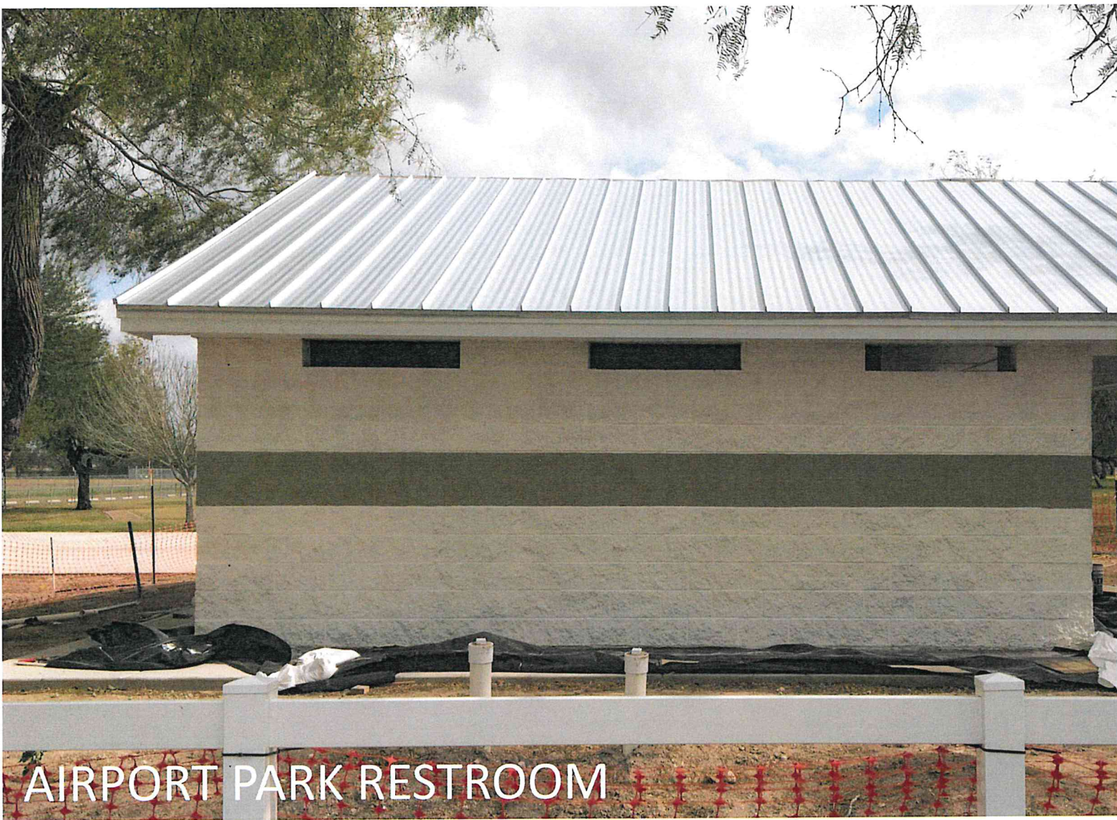
AIRPORT PARK RESTROOM